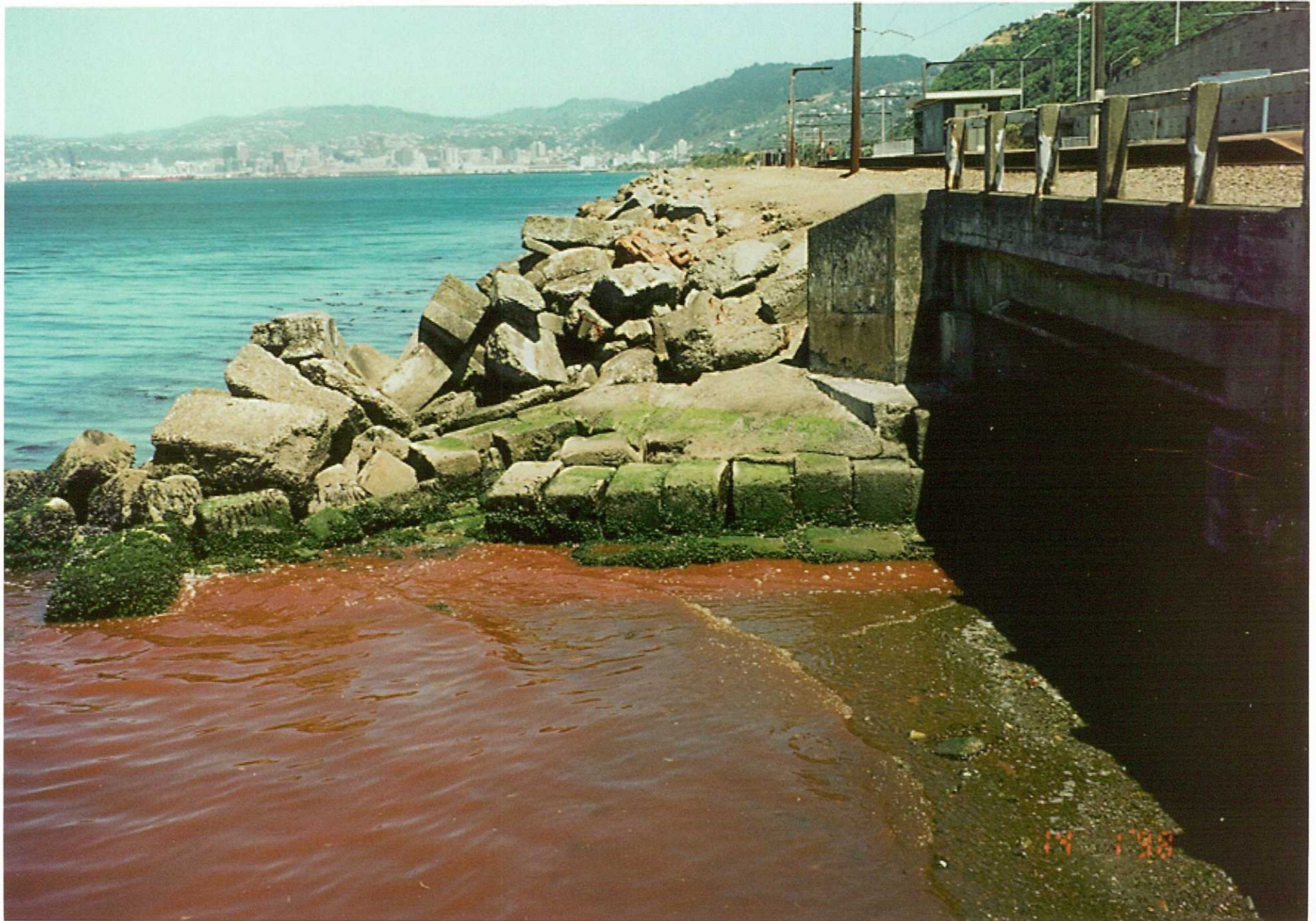
Greater Wellington - The Regional Council