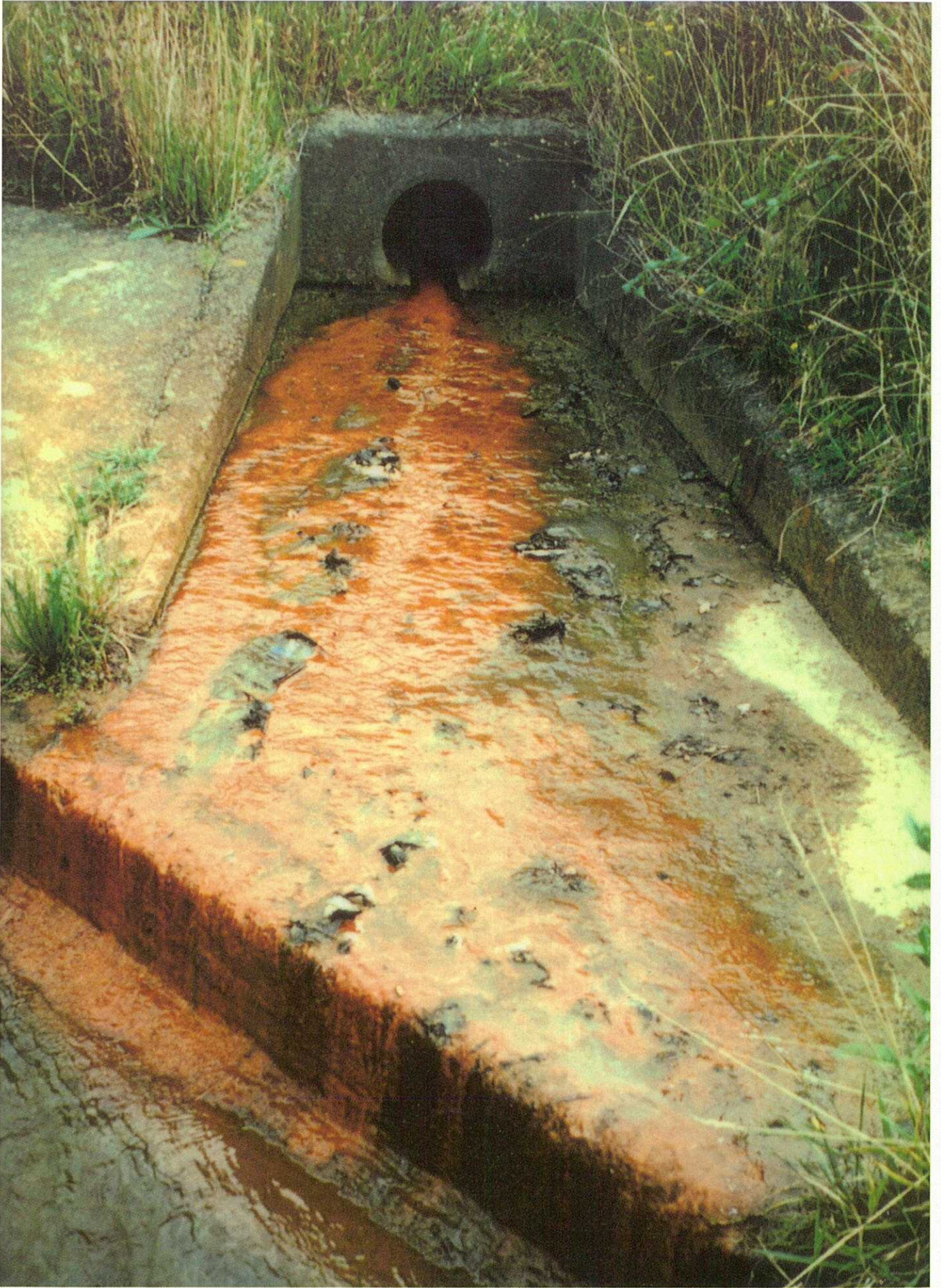
Greater Wellington - The Regional Council Take Action for Water - Photocard No.8