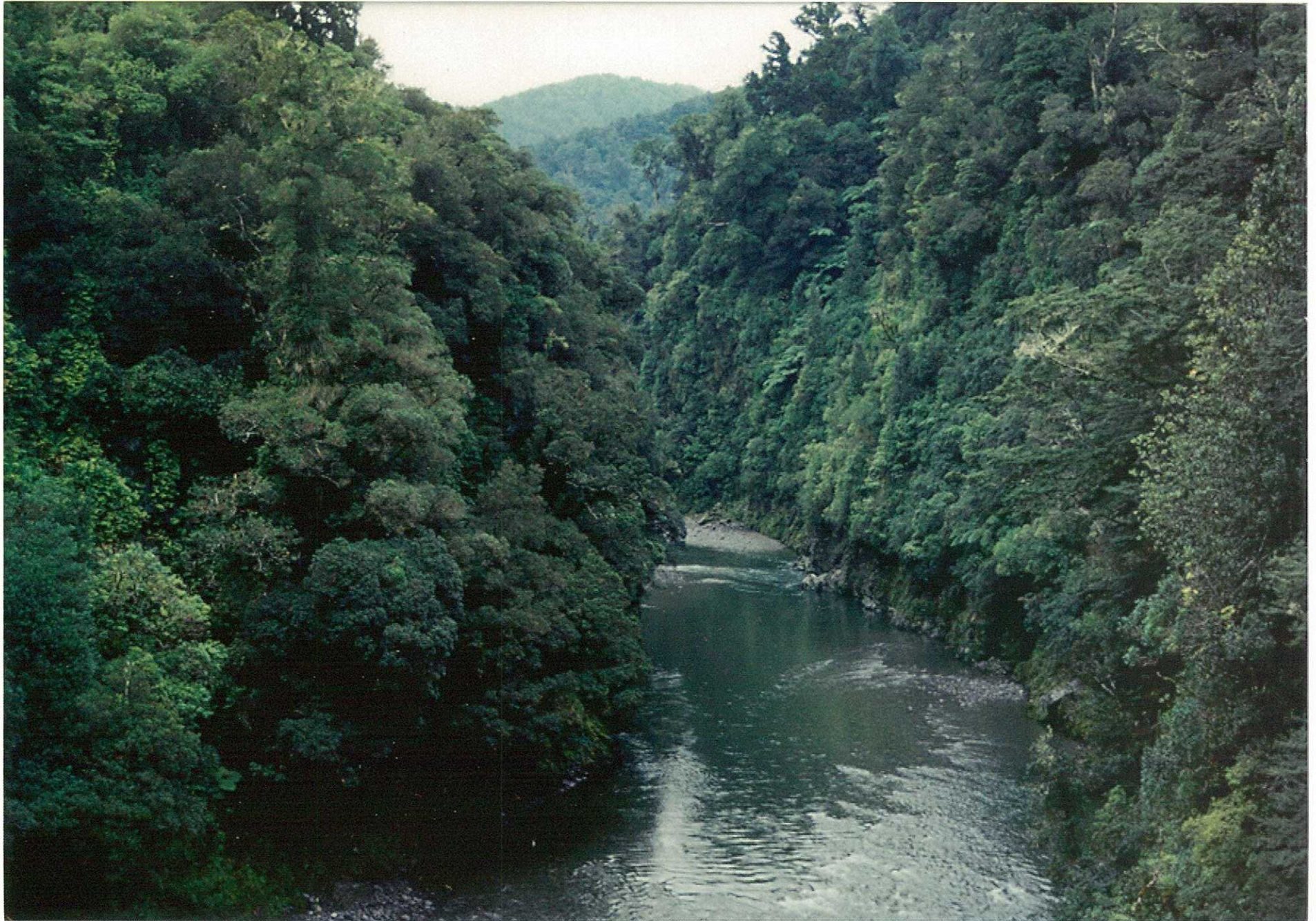
Greater Wellington - The Regional Council