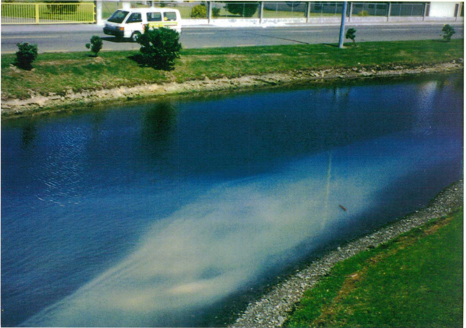
Greater Wellington - The Regional Council