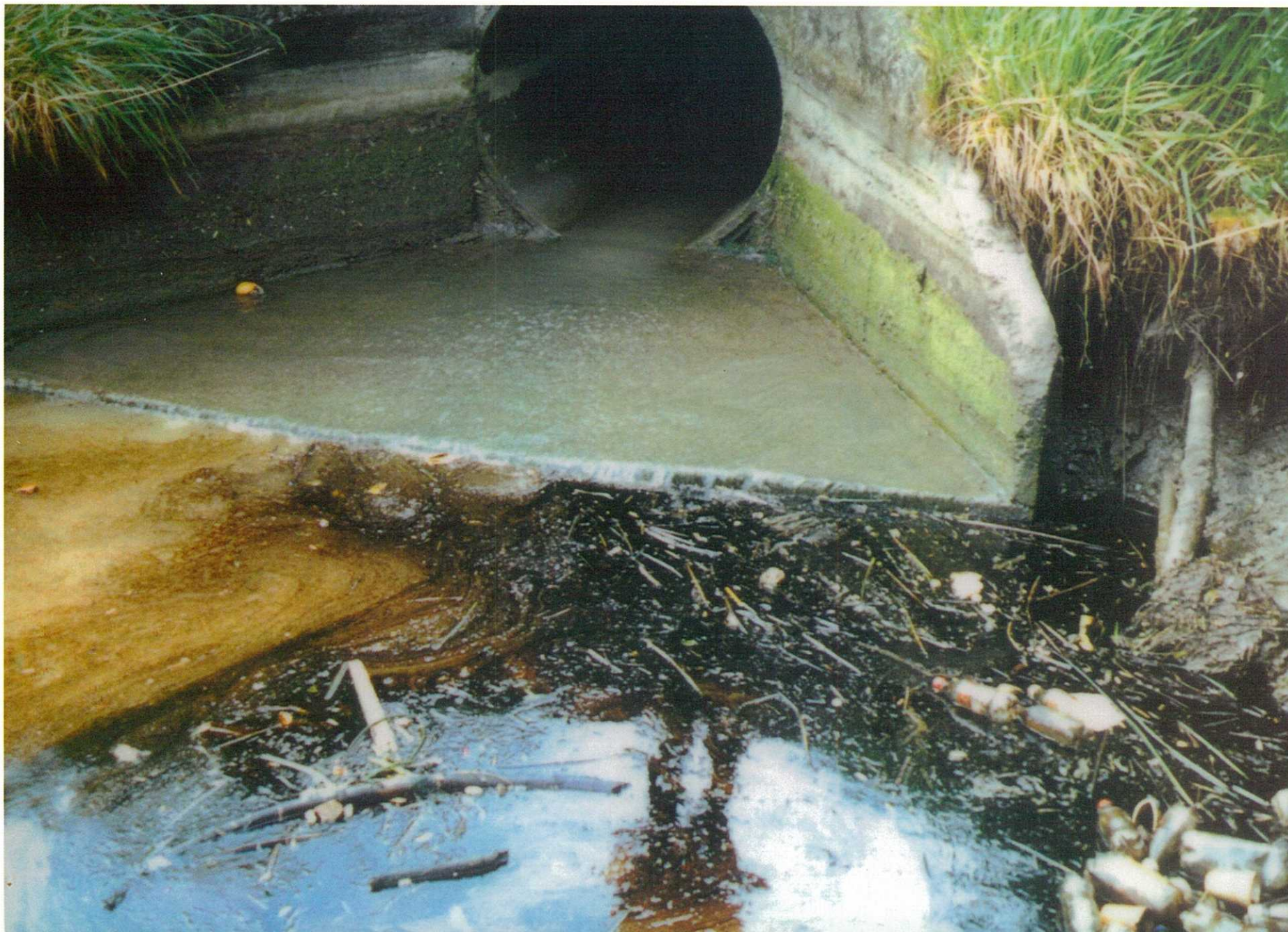
Greater Wellington - The Regional Council