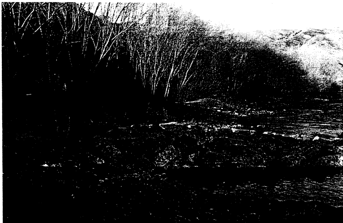
Series of rock barbs at Maple Lane Site

One of the barbs has extended almost to the gravel beach on the other side making it act as a weir in low flows. Perhaps a shorter barb would have been better.