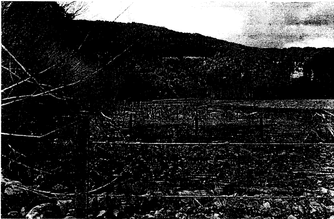
Series of rock barbs, debris fences and planting to reclaim an eroded section at Upper Taylor's

Rooted shrub willows have been planted extensively. Damage to plants by debris is a concern, but as the plants are already rooted and not rigid like poles, it is felt that some will survive.