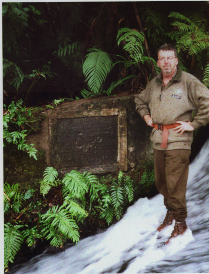
Korokoro Dam plaque rediscovered,