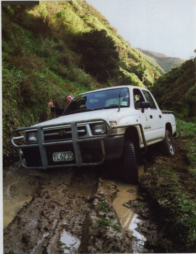
Korokoro Valley, Belmont Regional Park