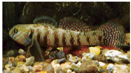
Male redfin bully