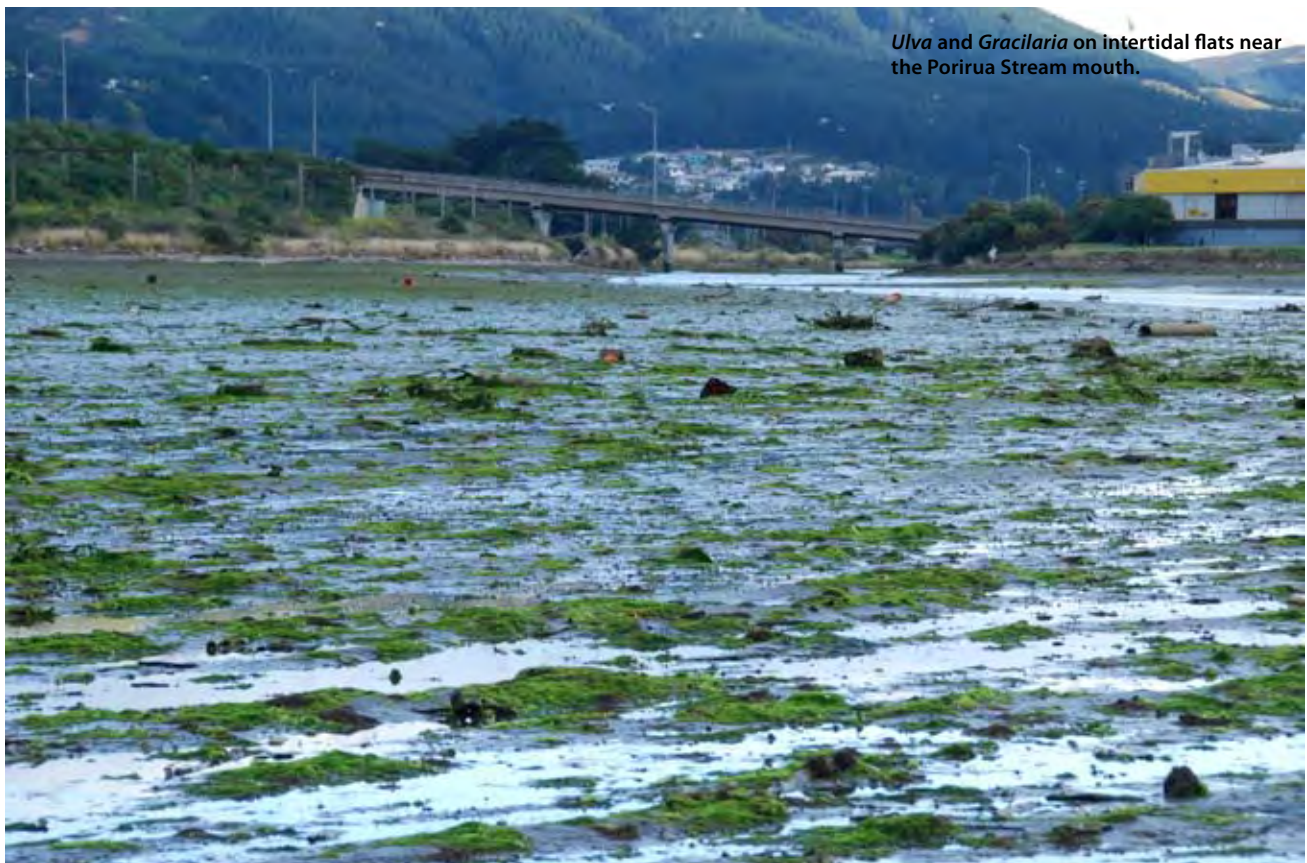
Ulva and Gracilaria on intertidal flats near the Porirua Stream mouth.