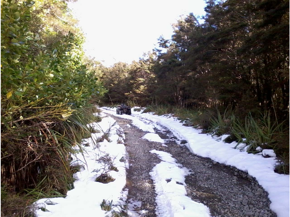
Installing aerial prefeed signage on Waiotauru Road in the Akatarawa's