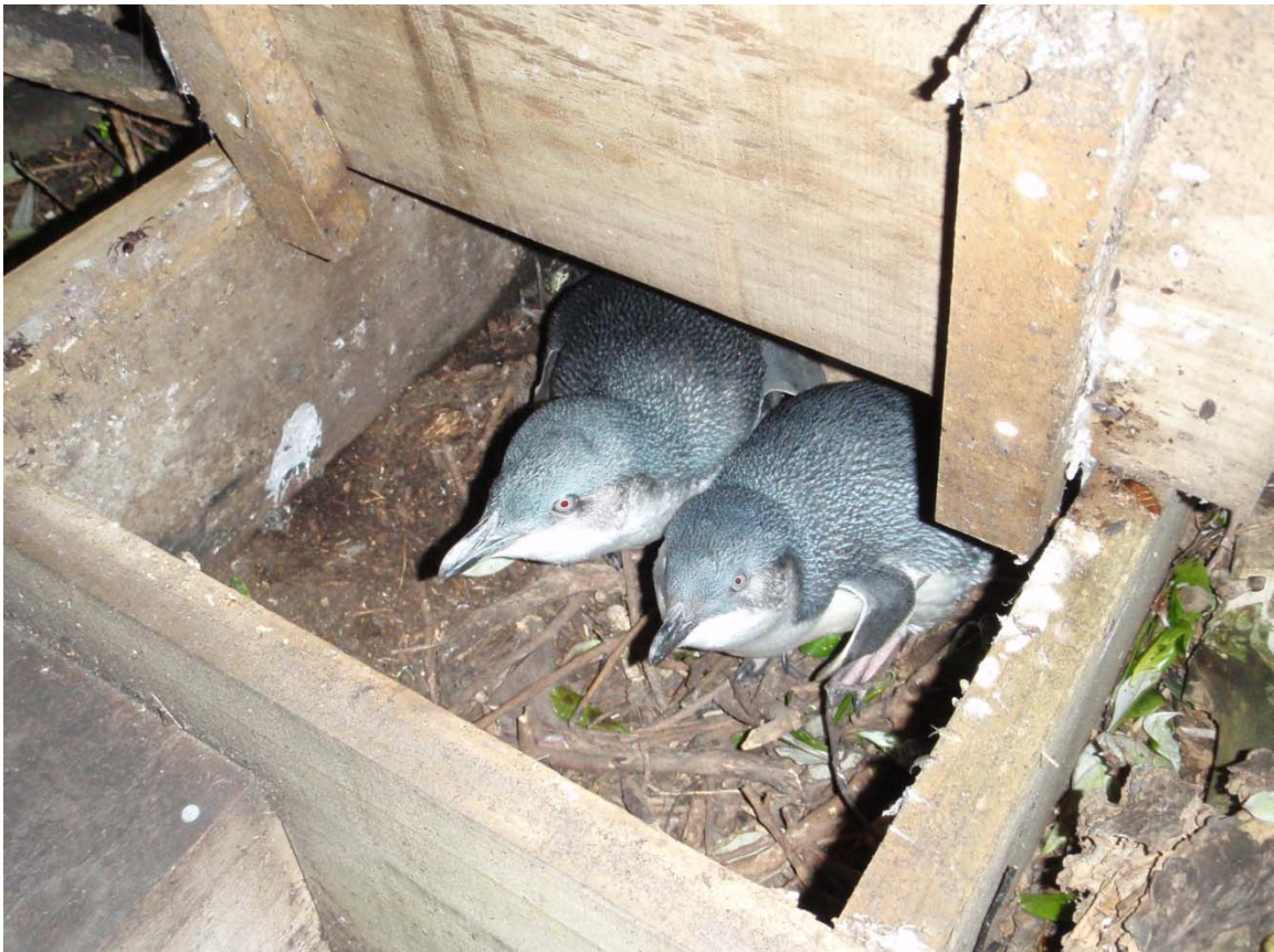
Nesting penguins interrupted at night in a nesting box at Moa Point, benefiting from mustelid control in place in the area.