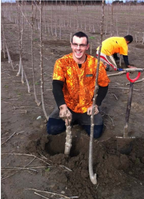
Blanking using rooted stock

planted along with 2,000 rooted cuttings that will replace failures in last year's block. This will leave 2 hectares to be planted in 2014, which will complete the extension to the Akura nursery.