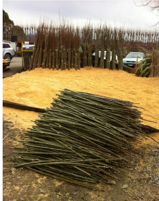
Wands being prepared for planting