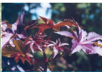
Castor Oil Plant