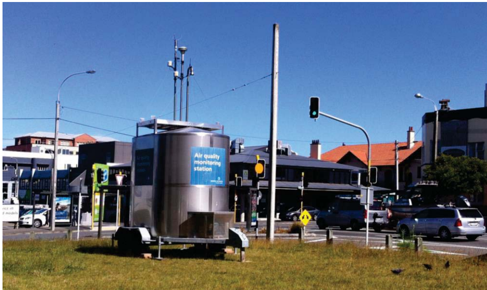
Mobile monitoring station on the new site at the corner of Willis Street and SH1