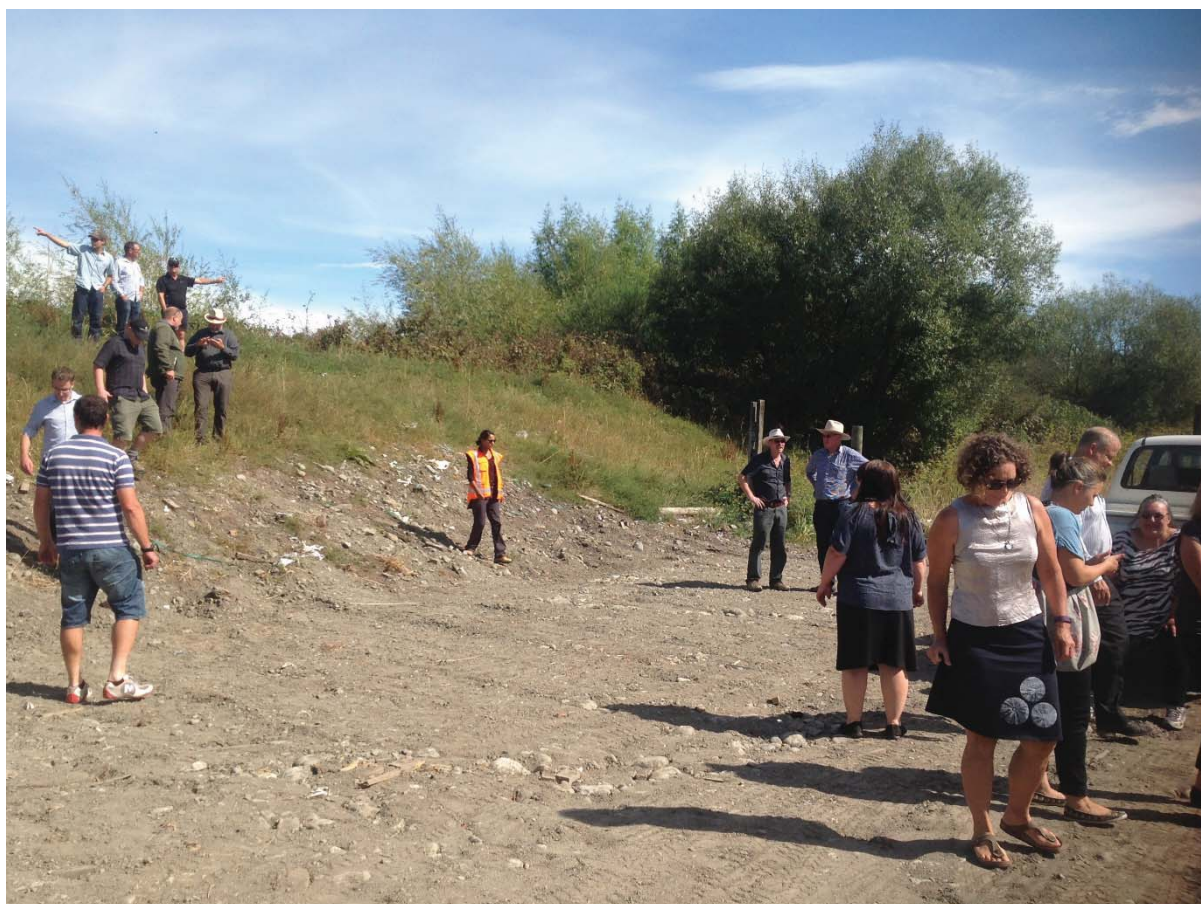
Figure 2: Stopbank on True Left Bank between SH2 and Railway Bridge