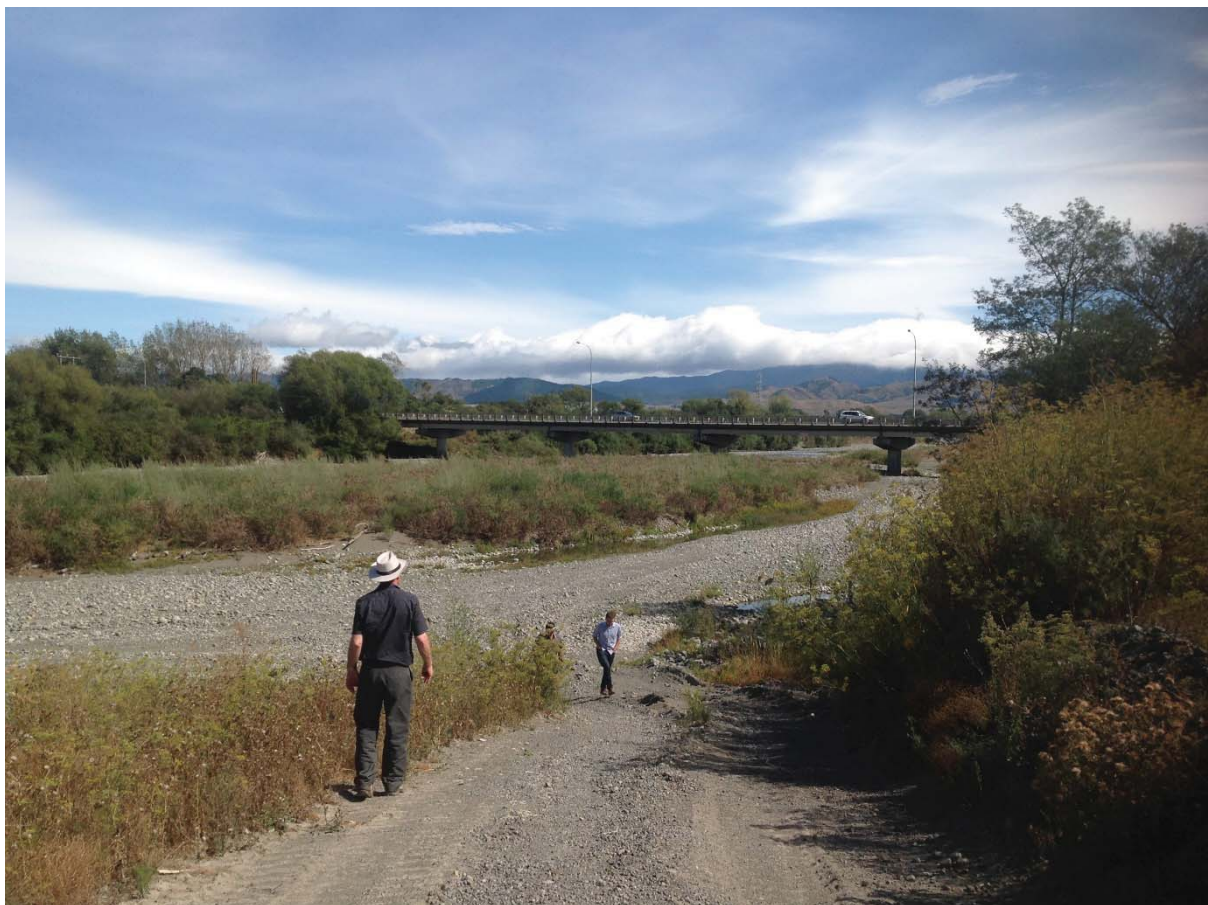
Figure 3: View of SH@ Bridge from Fulton Hogan Site