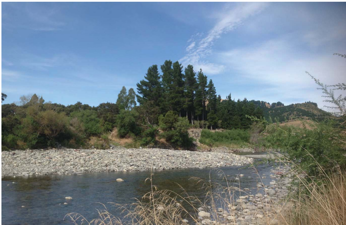
Figure 1: CDC Taratahi Water Race