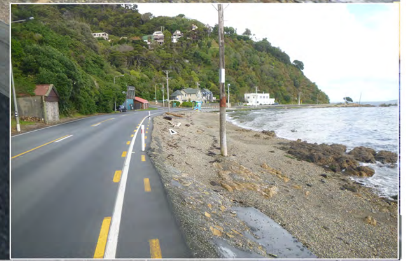
Simulated view of proposed 2.5m wide shared path