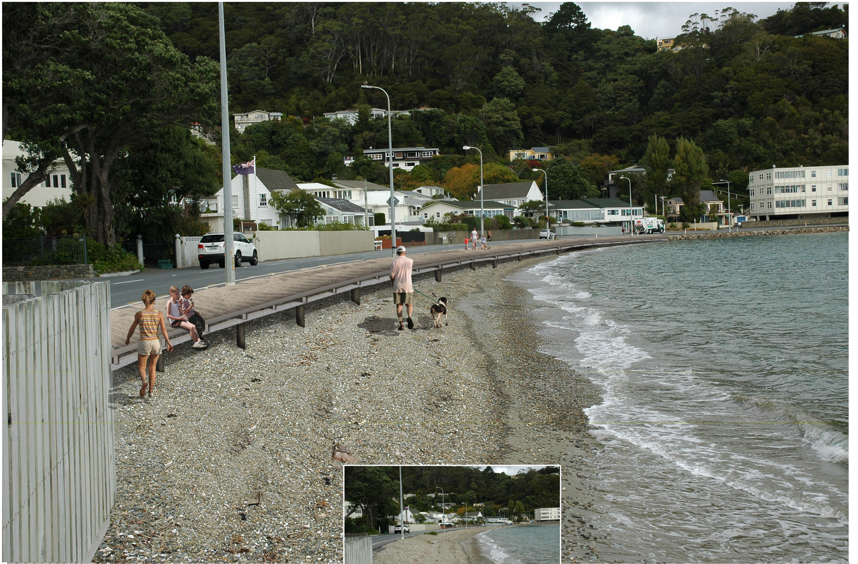
Simulated view of possible 2.5m wide boardwalk option located adjacent to beach