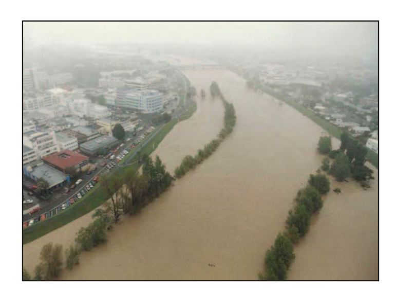
Figure 2: The Hutt River – Central Business District, October 1998