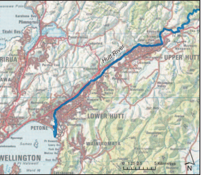
Figure 1: Location of the Hutt River (in blue)

The catchment covers 655 km<sup>2</sup> (that's more than seven times the area of Wellington Harbour!) and contains not only the Hutt River but also the Akatarawa, Pakuratahi, Mangaroa, and Whakatiki Rivers. All of these rivers feed into the Hutt River, so a storm in any part of the catchment could result in flooding