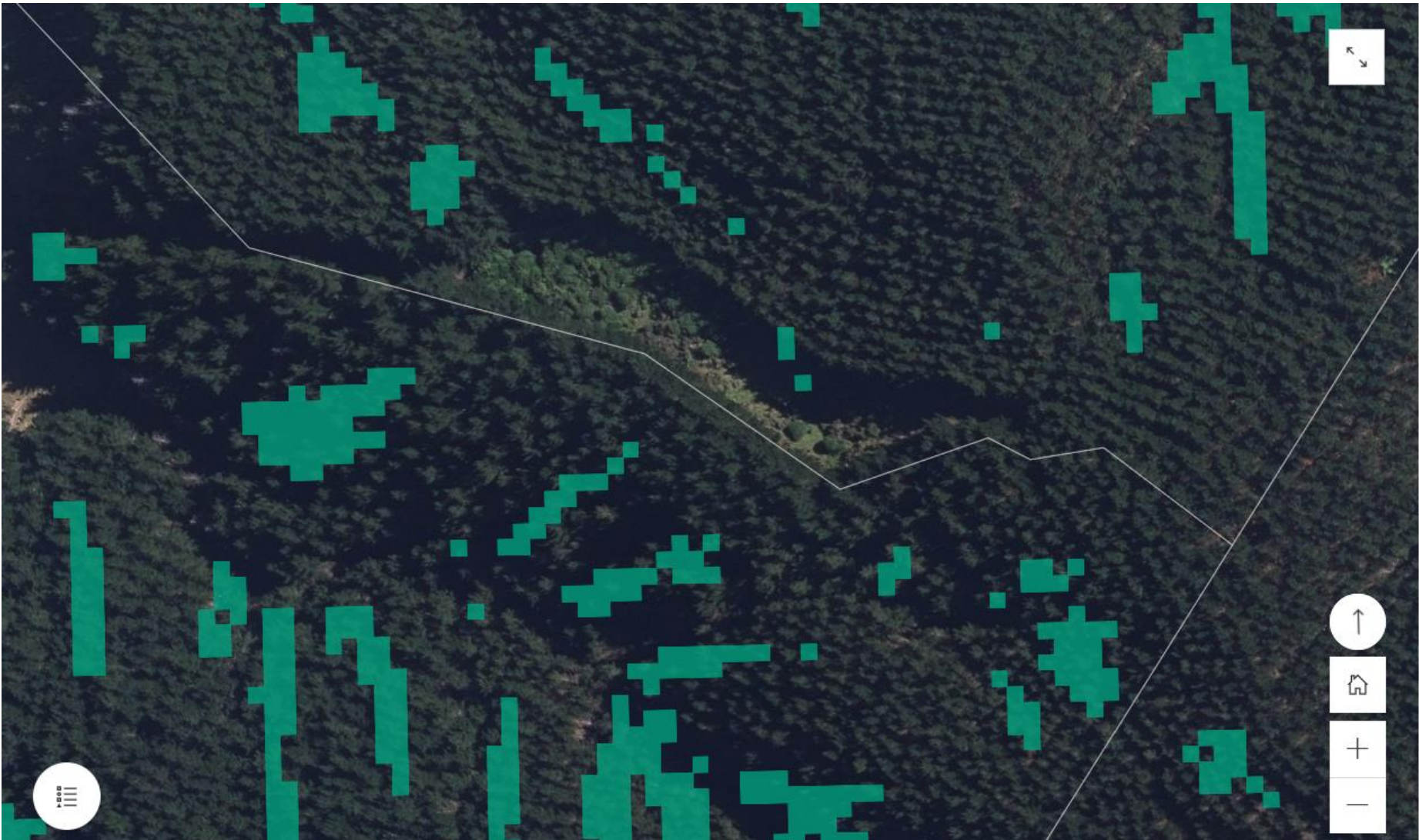
Example of areas deemed to be Highest Erosion Risk Land amongst an existing plantation.