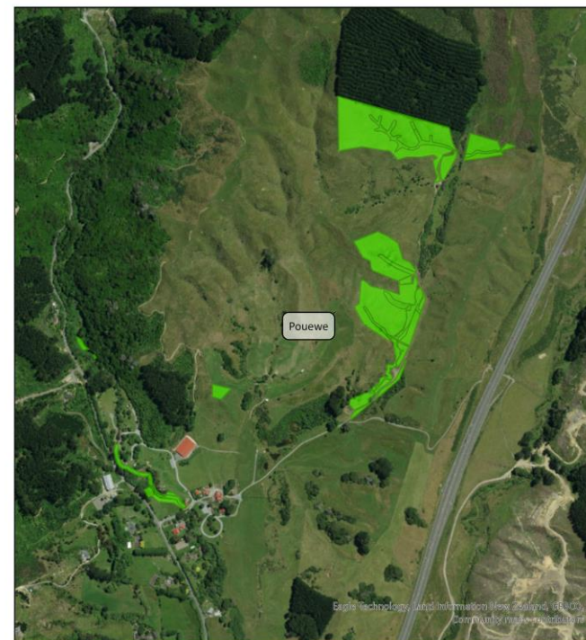
Recloaking Papatuanuku restoration in Te Awarua-o-Porirua 2021-24, by part FMU